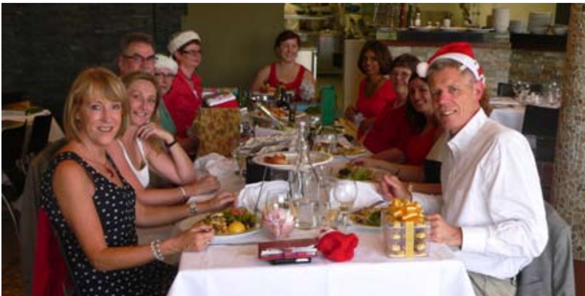
A chance to catch up with ACHSE NSW and Corporate Office staff over xmas lunch.